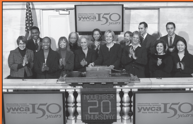
In honor of 150 years of service to New York City women, the YWCA-NYC was invited to ring the Closing Bell® at the New York Stock Exchange.