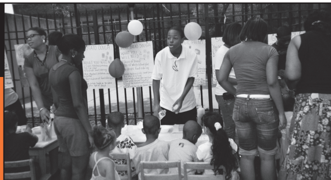
The children of the YWCA-NYC Brownsville Early Learning Center demonstrated their smarts at the annual Brownsville Science Fair.