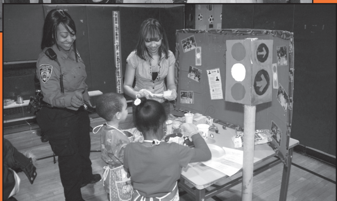
The YWCA-NYC After School Program at P.S. 329 celebrated Black History Month with a showcase of the students' many talents, including dancing, cooking and painting.